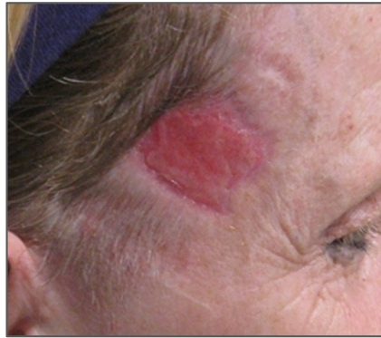
2 weeks after OASIS Wound Matrix application