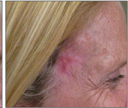
5 months after OASIS Wound Matrix application Complete healing with minimal residual erythema