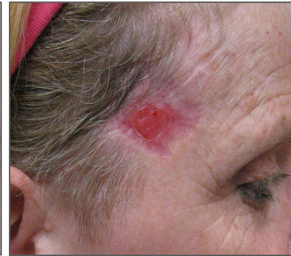
6 weeks after OASIS Wound Matrix application