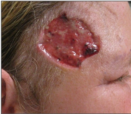
1 week after OASIS Wound Matrix application Wound decreased in size, with wound bed carmelisation