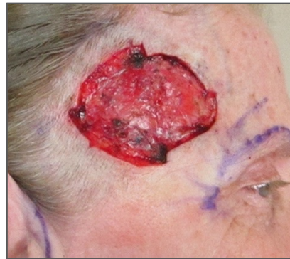
Day 0 Defect after excision