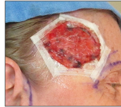
Day 0 OASIS Wound Matrix applied and affixed with Steri-Strips®