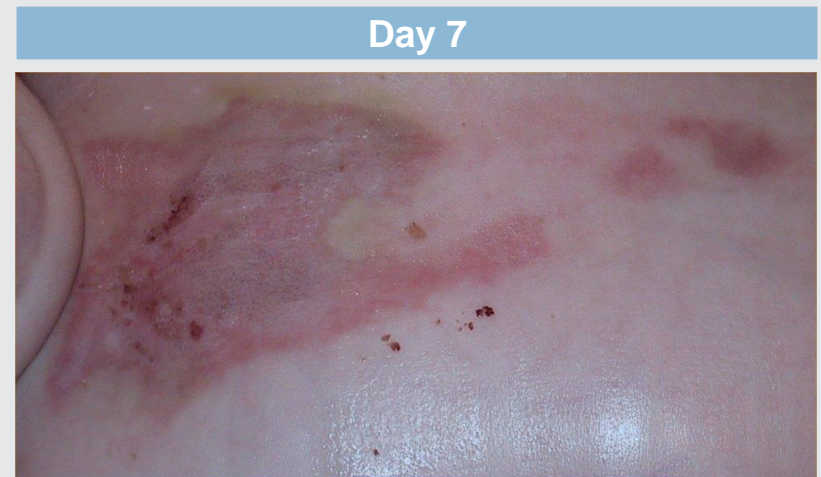
Dry OASIS removed

Mepitel is a registered trademark of Mölnlycke Health Care AB.