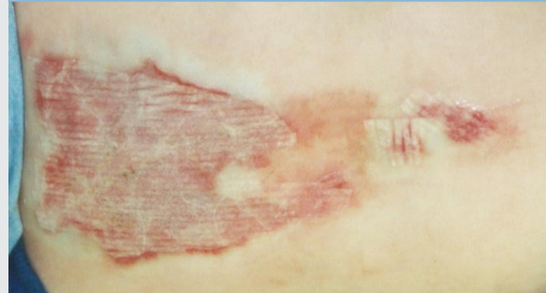
After OASIS application

Mepitel is a registered trademark of Mölnlycke Health Care AB.