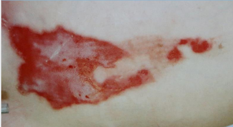
5 days after burn, prior to OASIS application