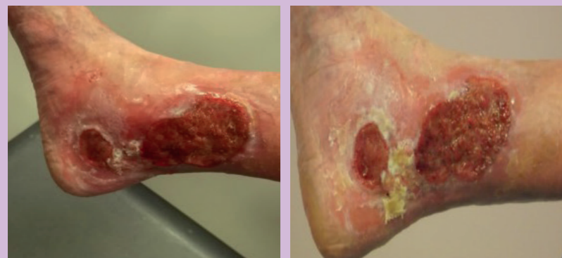
a) The wound at week 1 b) Week 2