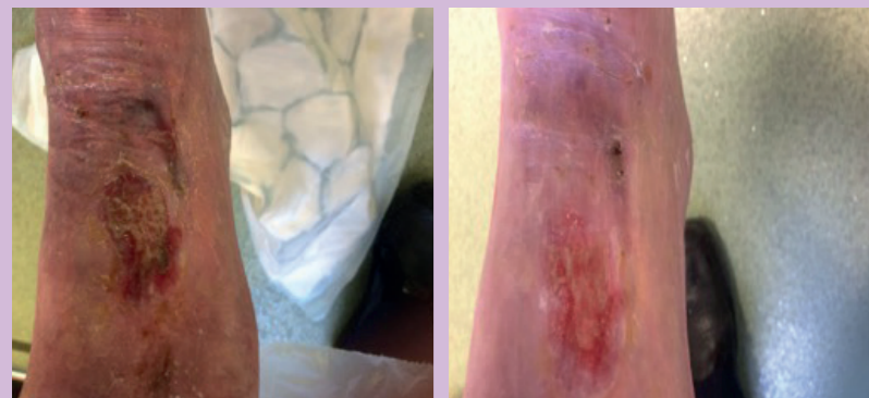
a) Wound at week 1, before treatment with Zorflex b) Wound at week 4, after three dressing changes